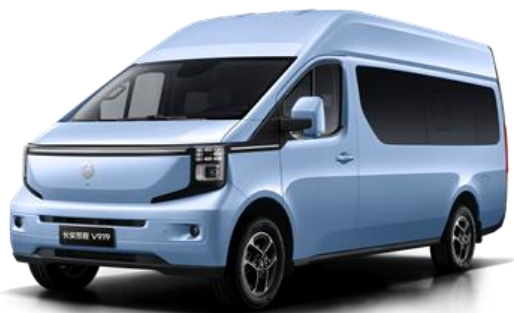
CHANGAN LCV V919

The fourth-generation EADO is powered by the New BlueCore engine with 500-bar ultra-high-pressure direct injection. All trims come standard with full-width front and rear LED digital waterfall light bars and an illuminated emblem. With a larger body size and a spacious rear cabin, it delivers enhanced comfort for family use. A foundation model is standard across the range, enabling AI-powered voice interaction driven by DeepSeek. In terms of safety, all trims are equipped with an "Ark Cage" body structure, six airbags, a 540° panoramic imaging system, and a high-definition onboard recorder. Built on five core strengths—All-Compass Design Philosophy, New BlueCore 3.0, SDA Cockpit, a spacious and comfortable interior, and all-dimensional safety—the vehicle sets a new benchmark for global intelligent family sedans.