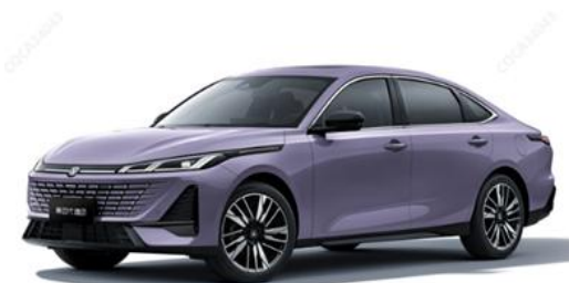
The fourth-generation EADO

In addition, the model features a one-touch SUPER RACE 3.0 driving mode, offering an enhanced performance-oriented driving experience. All variants are equipped as standard with Level 2 ADAS and an "Ark Cage" safety body structure, ensuring a high level of safety performance.