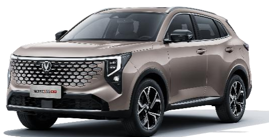
The fourth-generation CS55PLUS

The all-new CHANGAN NEVO Q05 was developed from the outset for global markets and is positioned as a high-quality urban all-electric SUV. The model is equipped with comfort front seats, delivering an enhanced in-cabin experience. With a trunk capacity of 540 L (including a 90 L underfloor storage compartment), it offers a spacious and practical interior. All variants are equipped as standard with CATL battery cells and support 3C fast charging, with a pure electric range of up to 506 km, effectively addressing range concerns. In addition, the model is equipped with LiDAR and a 4 nm automotive-grade cockpit chip, enhancing intelligent driving safety and user experience, and delivering strong overall value for global users.