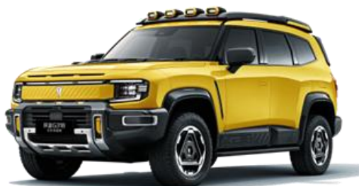
DEEPAL G318 SVP

All variants are equipped with the Golden Shield Battery using CATL battery cells, providing a high level of safety and reliability. The pure electric range reaches up to 670 km, supporting reliable and worry-free travel.