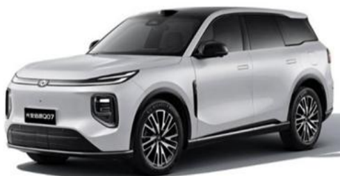
CHANGAN NEVO Q07

It offers a versatile mobility experience characterized by strong off-road performance, ride comfort, and visual appeal, providing reliable and comfortable mobility across all scenarios for users seeking quality and an outdoor-oriented lifestyle.