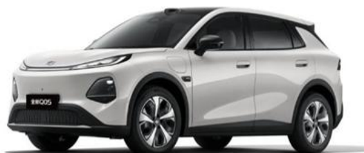
The all-new CHANGAN NEVO Q05

With a spacious interior, comfort seating across all rows, a premium suspension system comprising a front double wishbone and rear five-link independent suspension, as well as an 800 V platform with 6C fast charging capability, the model delivers strong overall product competitiveness. In addition, enhanced safety is supported by SDA Intelligence, further reinforcing its suitability as a high-quality new energy vehicle for family use.