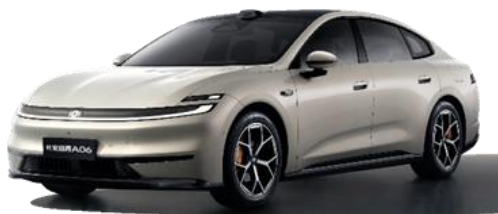
CHANGAN NEVO A06

CHANGAN NEVO A06 is the first strategic all-new family sedan introduced under the Company's new development positioning, and is branded as a premium, comfort-oriented family sedan. Built on a design philosophy inspired by light, and featuring a full-width signature lighting system, the model presents a distinctive and refined exterior design.