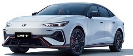
The third-generation UNI-V

The third-generation UNI-V is positioned as an intelligent sports coupe. All variants are equipped as standard with an active rear spoiler and a power tailgate, enhancing both driving dynamics and practicality.